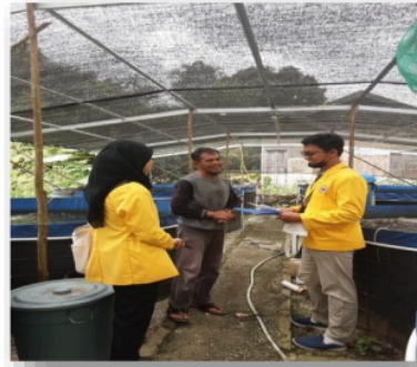
Figure 2. POKMAS Mekatami Raya Mandiri in Guntung Manggis Village.

Mekatami Raya Mandiri in Guntung Manggis Village. The activities carried out at the POKMAS are Papuyu fish farming, as shown in Figure 2 below: