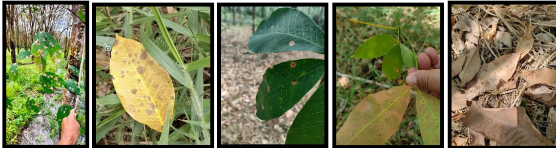
Figure 2. Symptoms of circle leaf fall disease in Barito Kuala Regency.