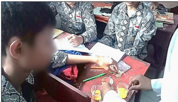
Figure 3. The Project Completion

The design and schedule that have been made are then carried out at the project completion stage (Figure 3).