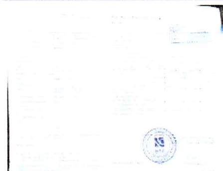
Payment Proof.jpeg 143K