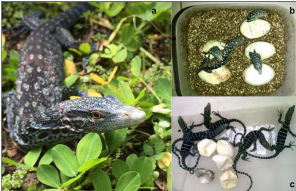
Figure 2. a. Adult, b. hatching, and c. hatchlings of Varanus macraei in a commercial reptile farm in West Java, Indonesia (Photos: E. Arida (a), B. Soetanto (b,c)).