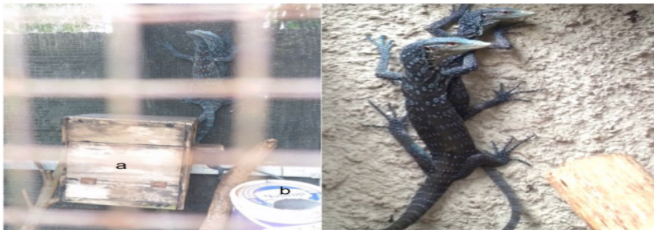
Figure 3. The pair of Varanus macraei observed mating in vertical position in their outdoor enclosure (left) and a pair of Blue tree monitor mating in an outdoor enclosure of a commercial reptile farm (right, Photo: T Wahyu).

After mating was over, both lizards showed normal behavior, including basking, preying on insects provided in the enclosure, drinking from the water bowl, and moving about once in a while. Lizards seemed to be resting in one position apart from one another for an extended time during the daylight, suggesting a passive nature.