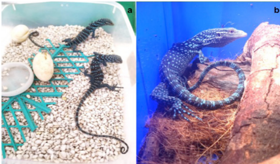
Figure 4. a. Neonates of V. macraei at hatching and b. a grown-up lizard of the two neonates at 18-month old.

Total lengths of hatchlings were 25.5 cm (SVL=10.0 cm) and 27.5 cm (SVL=10.5 cm) (Fig. 4.a). Body mass at hatching was 11 g and 12 g, respectively. One of the two hatchlings has been growing up to 78.5 cm in total length (SVL=20.5 cm, tail=58.0 cm) during the writing of this manuscript and was revealed to be a male based on palpation (Harlow, 1996) of the base of the tail (Fig. 4.b). Unfortunately, the other lizard was found dead after surviving for two months in the plastic container (Fig. 4.a).