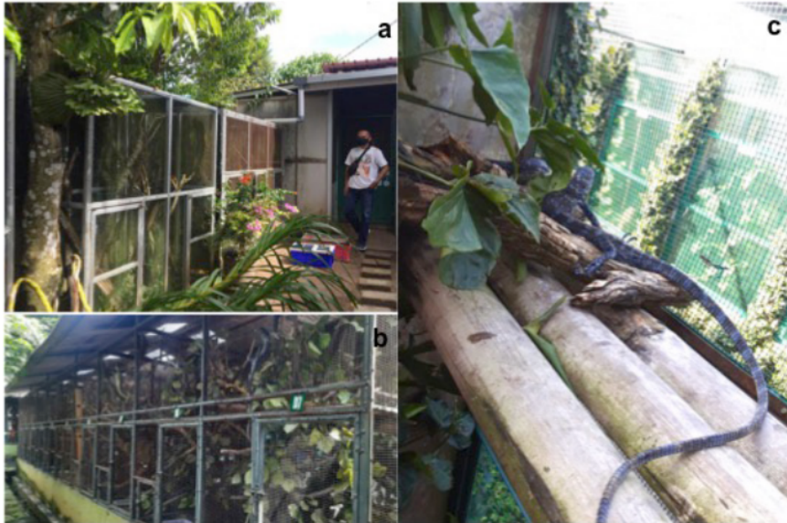
Figure 5. a. Outdoor enclosure setting used in our study, b, c. those of commercial farms in West Java.

the parallel breeding season for our lizards and those in the commercial farms due to some similarities in the settings of enclosures, which are placed open-air (Fig. 5). Thus, lizards follow natural breeding cycles in the generally uniform climatic parameters across the lowlands in Indonesia. Our finding on seasonal mating seems to be justified by a finding of a gravid female in June 2007 on Batanta Island (Del Canto, 2013).