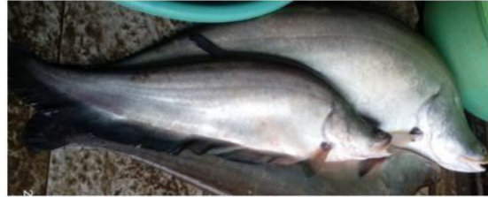
Figure1. Sample of the giant featherback from Barito Kuala District

[7], the featherback with medium size reach maximum of 100 cm length with average weight of 0.5-1 kg, while in nature it can reach up to 2-4 kg of fish. Its body shape is flat with small head size and at the nape of its neck looks hunchback. Maxillary located far behind the eyes, and the body is covered with small scales. Scales on the back is gray while in the belly is silvery white. The sides are white circles as black balls, each surrounded by a white circle. With increasing age, body decoration flat fish will disappear and be replaced by lines of black.