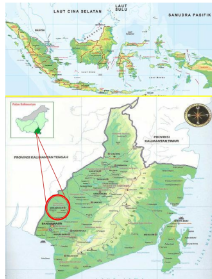
Figure2. The map showing the investigated area in Barito Kuala District, South Kalimantan Province