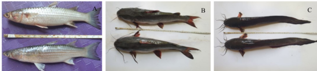
Fig. 2. Fish species used in the Study A: Mugil cephalus ; B: Arius sagor ; C: Plotosus lineatus

The fish samples included Plotosus lineatus , Arius sagor and Mugil cephalus . Local fishermen obtained these specimens from coastal swamp wetland waters (Fig. 2).