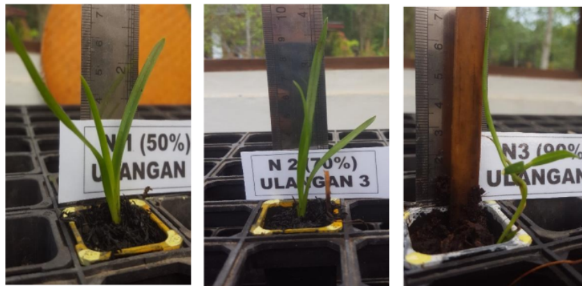
Figure no 1: Results of tiger orchid acclimatization at different shade levels

The effect of independent shade was significantly different on the number of leaves. In (Figure 1) it can be seen that plantlets of tiger orchids on paranet 90% with the same medium, namely husk charcoal, experienced growth disorientation. It was due to the light intensity at paranet 90% only 52 \mu\text{mol m}^{-2} \text{s}^{-1} .