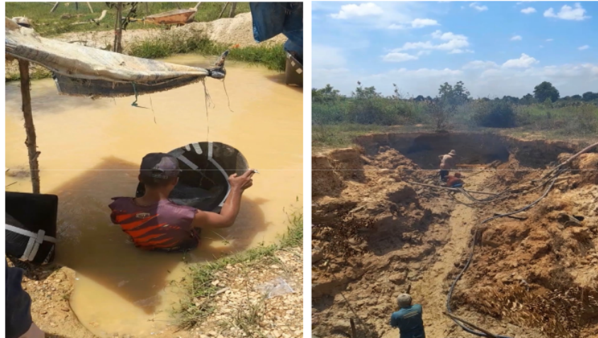
Figure 3. The diamond mining process.

The scorching sun cruelly shines on the dry ground of Sarang Tiung Village, its unforgiving rays reflecting the relentless labour of the diamond miners below. In the Cempaka District, fantasies of great wealth are pursued with sheer tenacity, using bare hands instead of tools like pickaxes and shovels. However, beneath the enticing prospect of riches comes a harsh reality much bleaker than the tales spoken by heated rocks.