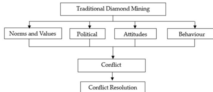
Figure 1. Source of conflict.

contribute to the continued viability of traditional mining methods [35–37], even in the face of modern alternatives.