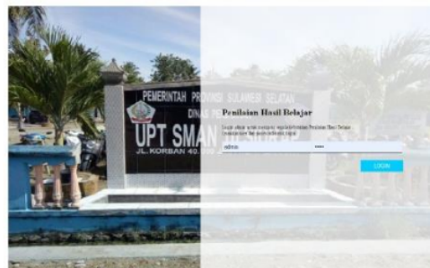
Figure 1. Initial view of admin user CBT

This stage is the process of inputting the assessment instrument into the form of a computer-based test in the form of a Computer Based Test (CBT) as a learning outcome assessment tool. This Computer Based Test (CBT) has an offline feature so that there is no need to access the internet which can consume a lot of network data usage, besides that it is also equipped with several components that can make it easier for teachers to efficiently recapitulate final grades. This CBT application can minimize the school's budget for spending funds which in the previous year cost a lot because it was still in the form of a paper test. The following is a CBT product display as follows: