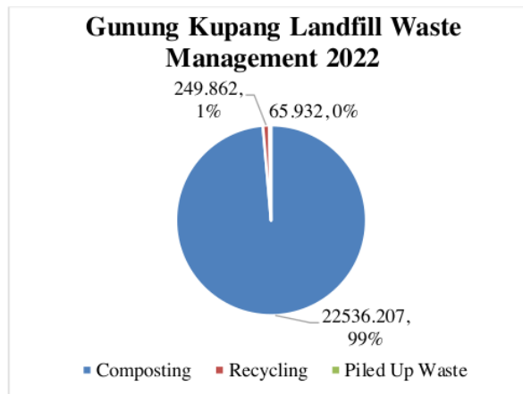
Fig 1. Waste Management at Gunung Kupang Landfill in 2022

tonnes/year. Waste processing is needed to protect or prevent too much land from being polluted by pollution [35]. The main effort that must be carried in environmental management is the prevention of environmental pollution or damage, while pollution control is the last step [36]. More detailed data is presented in the image below: