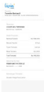
Bukti Transfer An. Febriyanti Puteri Lestari.jpeg 30K