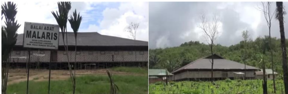
Figure 3. The Customary Hall of The Dayak Meratus adat community

The homes of the indigenous Dayak Loksado indigenous people are called balai. There is a central building in the middle, surrounded by other buildings called umbun, where all the residents live. The central building is also a gathering place to carry out traditional ceremonies, known as the aruh. Small bridges are attached to each of the umbuns (see Picture 3).