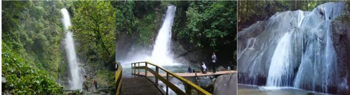
Figure 2. Waterfalls-Natural Tourism Potential

Hill, Paku Tadung Hill, Panipulungan Hill, Tariban Hill, Tatapan Hill, Mt. Kentawan Camping Ground, Ranuan Cave, and others