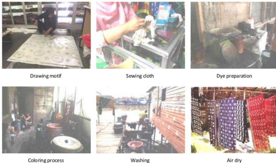
Figure 3. Some illustration of traditional processing of Sasirangan