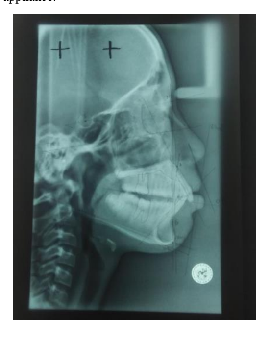
Figure 6. Post-treatment cephalometric radiograph.

After 9 months of twin block use, the molar relationship became Class I Angle with 5 mm overjet and 7 mm overbite (Fig. 5. c, d). Cephalometric analysis showed: SNA 82°; SNB 79°; ANB 3°, which was Class I skeletal relation (Table 1 & Figure 6). There were visible changes in the face: profile balance or harmonization and the function of the craniofacial muscles was improved (Figure 7). To obtain perfect results, further treatment using fixed orthodontic appliances was performed after treatment with twin block appliance.