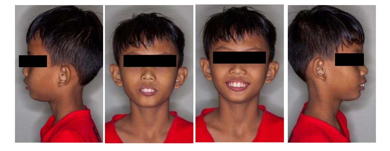
Figure 1. Pre-treatment extraoral photographs

facial profile and incompetent lips (Figure 1). On intra-oral examination, there was gangrene radix on teeth 55 & 65, protrusion of anterior teeth (overjet 14 mm, overbite 7 mm), maxillary model discrepancy -9 mm, mandibular model discrepancy -3 mm, diastema on teeth 14-13-12-22-23-33-34-41-42-43-44, 1 mm median line shift to the left, Class II Angle permanent molar relation (Figure 2). The patient's oral hygiene was good and there was no gingivitis or periodontitis. He had normal labial, lingual and buccal frenulum, normal tongue, normal tonsils and high palate. On panoramic x-ray examination showed the permanent teeth were perfectly erupted. The lateral cephalometric analysis shows a normally positioned maxilla and mandibular retrusion (SNA 82°; SNB 74°; ANB 8°, CVM CS 4 (Figure 4)). Evaluation of patient's cervical radiograph indicated that he considerable amount of growth remaining. Based on clinical and radiograph examination, the patient was diagnosed with Class II Angle Division 1 malocclusion. The patient was treated using removable twin block for Class II appliance.