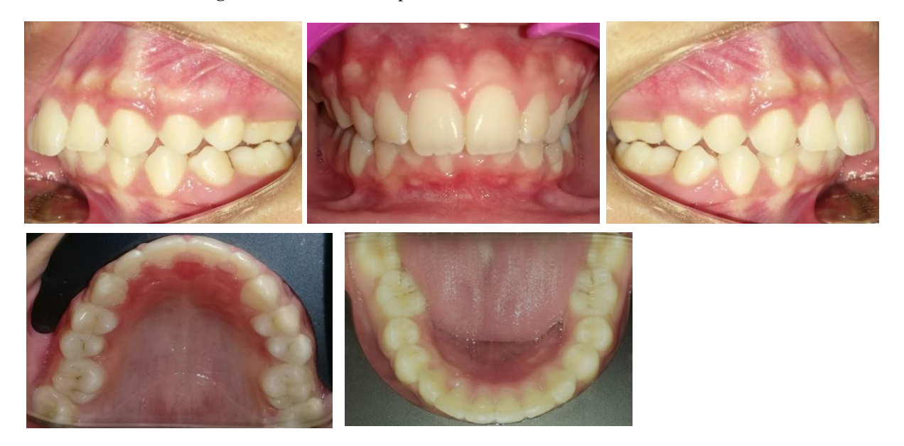
Figure 8. Post-treatment intraoral photographs.