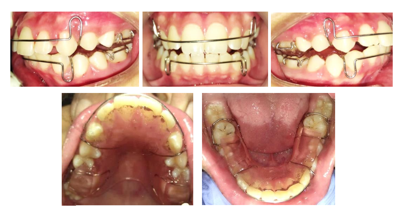
Figure 5. Intraoral photographs with twin block appliance.

Both blocks had an occlusal inclination of 70°. For retention, Adam's clasps (0.8 mm) were placed on all first molars, as well as labial arches on both maxillary and mandibular anterior. The steep inclined planes interlocked at about 70° to the occlusal plane.