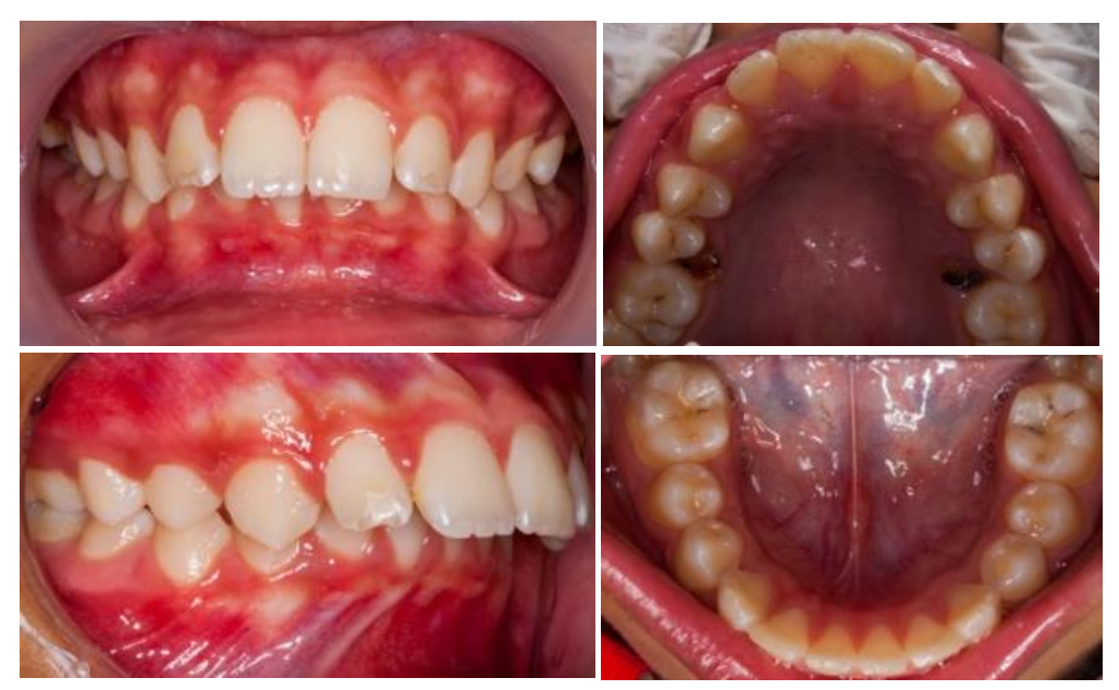
Figure 2. Pre-treatment intraoral photographs