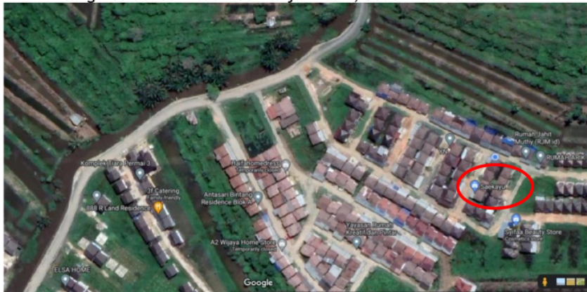
Figure 1. Location Map of Community Service Activities

This activity was carried out at SAEKAYU Crafts, at the Antasari Bintang Residence Block I30 Banjarmasin, South Kalimantan.