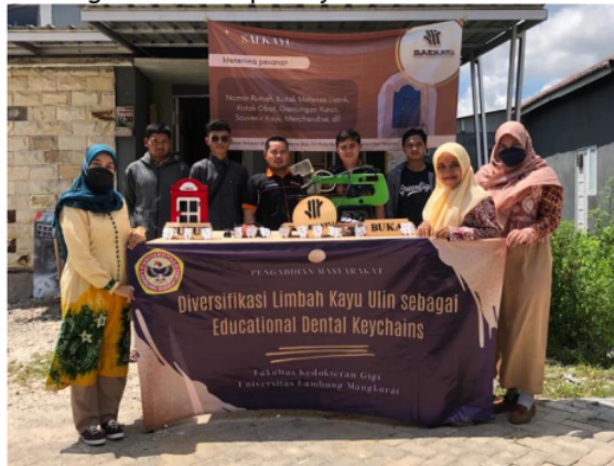
Figure 4. Community Service Team

In addition to providing benefits for SAEKAYU, this product is also expected to increase dental and oral health knowledge. According to Jalanti, Sanuddin Putra (2018), keychains are believed to be effective as media for promoting information to the public in health education. The advantages of keychains are that they are smaller in size, easy to carry, read, and attractive as souvenirs compared to other image media, which are larger and designed to be explicitly read.