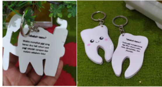
Figure 2. Examples of diversified products