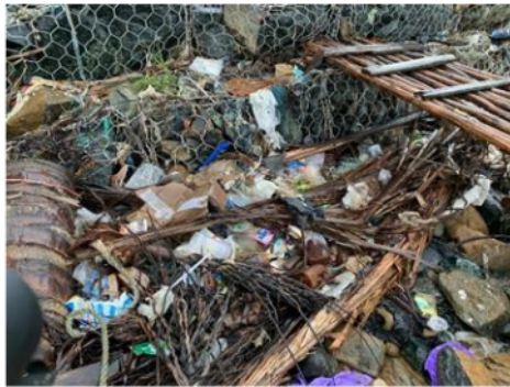
C. Garbage pile