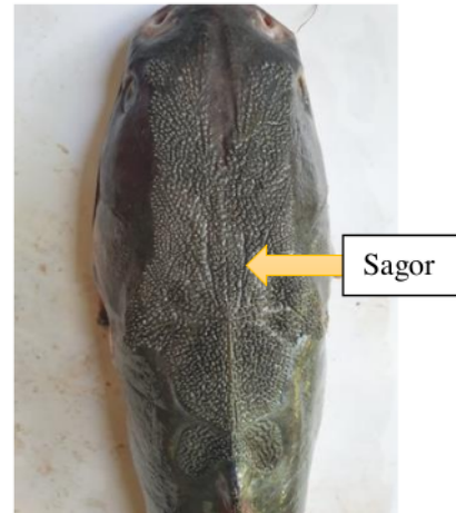
Fig. 3b. The head of the sea catfish ( Arius sagor ) showcases a distinctive hard plate that exhibits a bilateral pattern like a pair of butterflies (sagor) situated on both the left and right sides of the head