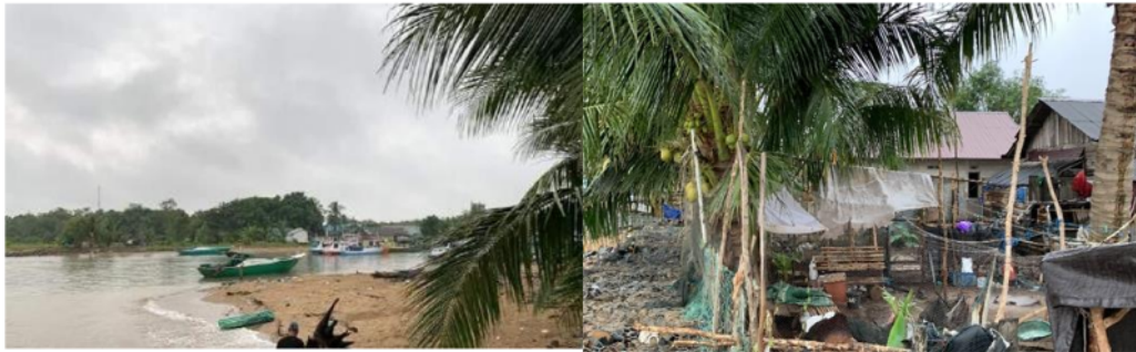
A. Fishing boat traffic

Subsequently, the samples were examined in accordance with the standard methods as outlined by the SNI.