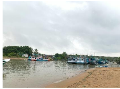
D. Shipping dock