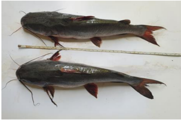
Fig. 3a. Sea catfish ( Arius sagor ) morphology