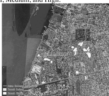
Figure 1. Map of Pelambuan residential area, West Banjarmasin (Identification of Slums in the 2015 Mayor's Decree)

area not being fully utilized by investors due to a lack of promotion and information about the potency area. Figure 1 shows the Pelambuan area with distribution locations slum settlements with Low criteria, Medium, and High.