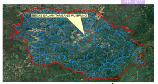
Figure 2. The location of Pumpung Post-Mining Sp. @