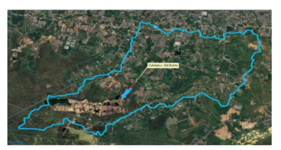
Figure 1. The location of Danau Seran Post-Mining