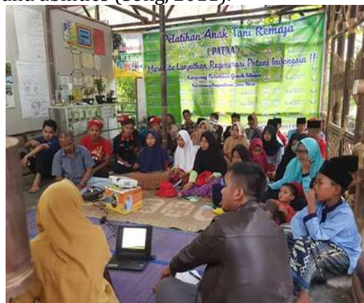
Picture 05 Learning activities PATRA at Pondok

In a close relationship, the learning activities of members in the KTS, KWT, and PATRA programs are very conducive. The environment plays an important role in supporting and building cooperation and trust among the components of the program. The administrators provide material clearly and easily understood by the participants so that the reception of the material is very good. This is supported by the very close and reciprocal relationship between the management and participants in the program. The activities in the lodge are very intimate and there is no visible distance between the administrators and the participants. Homans describes the concept of individuals involved in the group exchange process, namely activities, interactions, and feelings. The involvement of individuals with social trust in a group or network is social capital to be able to develop their potential and abilities (Song, 2011).