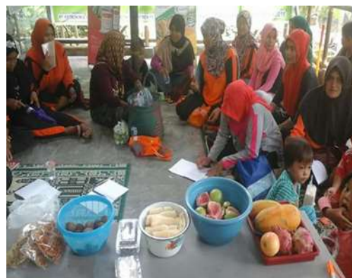
Picture 03 Material Activities and Practices of Processed Food and Beverages

program, these women farmers are expected to increase their family income).