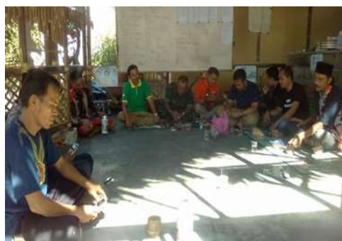
Picture 02 Material Giving Activities of KTS at Pondok