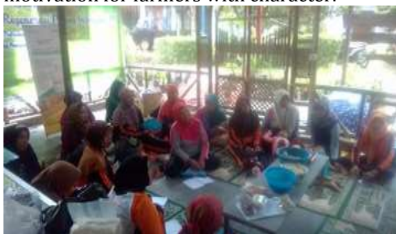
Picture 04 Processed food manufacturing activities

These programs include rice, corn, soybean agribusiness, catfish farming, goat and sheep agribusiness, fruit vegetable horticulture agribusiness, processed food and beverages, workshops, sustainable food house area (KRPL), manufacture of vegetable pesticides, seeding of vegetables, crops family medicine (TOGA), TAMBULAPOT, handicrafts, motivation for farmer regeneration, and motivation for farmers with character.