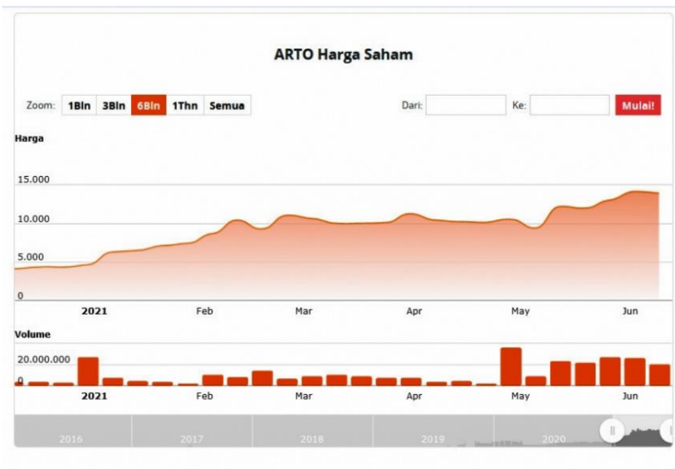
Figure 2. Stock Value of PT. Bank Jago Tbk (ARTO) Period 28 December 2020 to 21 June 2021