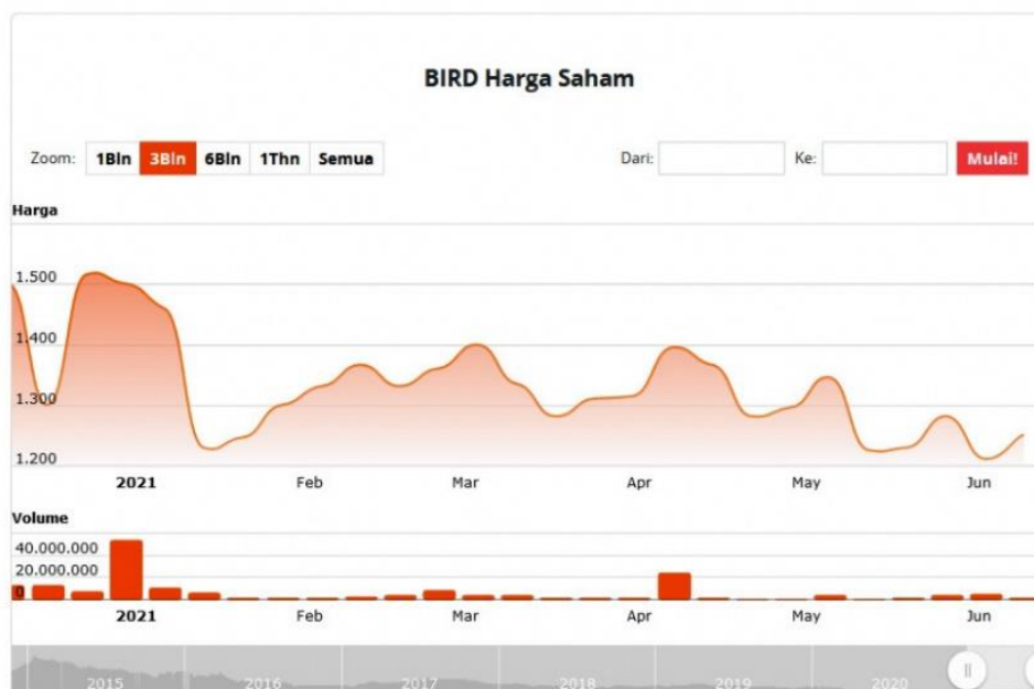
Figure 3. Stock Value of PT. Blue Bird Tbk (BIRD) Period 28 December 2020 to 21 June 2021

Seeing the movement of Gojek stock investment chart in several companies that experienced a significant increase after the official announcement of Gojek's merger with Tokopedia on May 17, 2021. The increase in the value of the shares is clearly seen especially in the shares of PT Bank Jago Tbk (ARTO) where Gojek dominates the shares by 21.04 percent