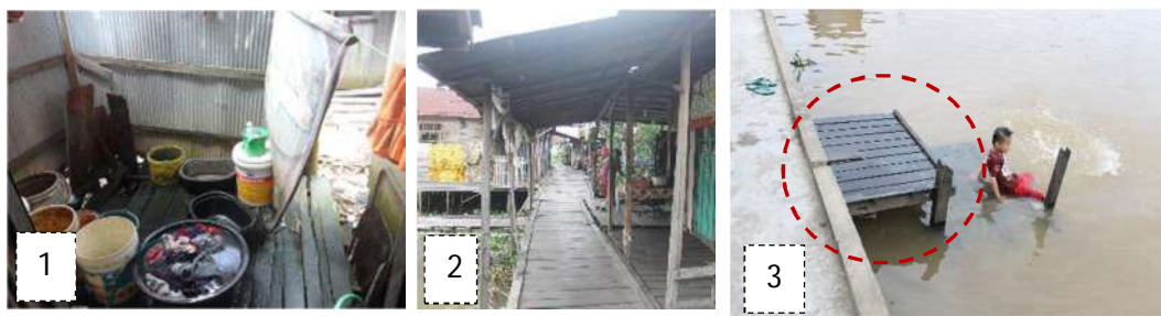
Figure 2. Pembanyuan (1 ), titian (2) and batang (3)

Houses on the riverbanks have batang as a service area that connects directly with the river located behind or beside the house. On houses on the edge of the land some have batang , and some do not. Those that have batang are the houses that are still inundated by water at low tide. The position of the batang is in front of the house.