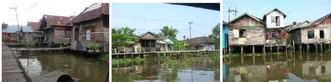
Figure 1. The stilts house on riverside

The most common type of house found in riverside settlements is house on stilts with construction poles of more than 2 m long in anticipation of the river. There are two types of stilt houses based on their position on the river: stilt houses on the riverbanks and stilt houses on the edge of the land. Stilt house on the riverbanks is above the river body with orientation to the titian (path with pole structure) and its back to the river. The stilt house on the edge of the land is located between the riverbank and the mainland. During high tide there will water below the house, but at low tide there will land. The edge of land stilt house is oriented towards the river.