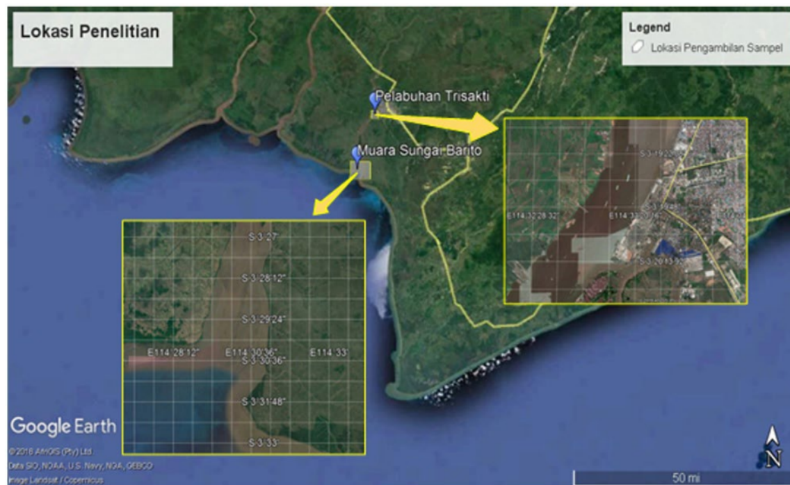
Figure 1. Site sampling for water and sediment in the Barito river estuary

Shrimps samples were dried at 105°C to constant weight, and then the samples were ground and sieved. Detailed preparation of shrimps samples and determination of Pb, Cu, and Cd using atomic