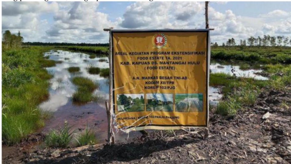
Figure 2: Food Estate in Kapuas Regency (Wahana for the Environment, Prints New Paddy Fields in Kapangai Kapuas Regency)

The Food Estate Program in the form of agricultural land intensification can indeed be said to be not a problem for the environment. What has the potential to become an environmental problem is the Food Estate Program in the form of extensification, namely printing new rice fields. Various problems did arise, starting from the expertise of local farmers, the wrong planting time, budget problems, changes in farmer culture.