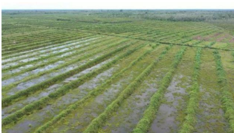
Figure 3: Food Estate in Kapuas Regency

Back to the synchronization of legal policies between laws and regulations made in the Environmentally Friendly National Food Barn Program (Food Estate) in Central Kalimantan. Is this program in sync with laws and regulations related to the environment? Researchers try to analyze it.