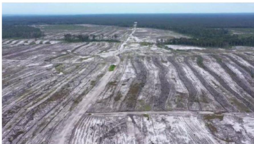
Figure 1. Food Estate in Gunung Mas Regency [The cassava plantation stands are estimated to be +600 hectares in Tewai Baru Village, Gunung Mas, Central Kalimantan (Quin Pasaribu BBC News Indonesia, 2023)]

The picture above is a cassava plantation, one of the projects of the National Strategy Program in the form of a Food Security Program (Food Estate) (Quin Pasaribu, 2023).