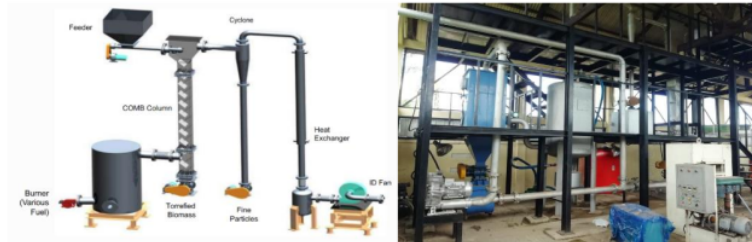
Figure 1. Torrefaction Equipments [11]

The torrefaction process was carried out at the Integrated Agriculture Laboratory, Tropical Biomass Research, and Development Center, Lampung University. The series of torrefaction devices is shown in Figure 1.