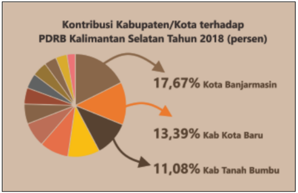
Figure 2: Contribution of Districts / Cities to South Kalimantan's GRDP in 2018 (percent)