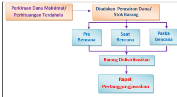
Figure 2. Process of Designing a BPBD Assistance Distribution Mechanism

In the implementation of the duties of the Gunung Mas District Disaster Management Agency, it has the following functions: