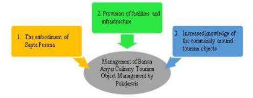
Figure 1. Management of culinary tourism objects in Banua Anyar Village

environmental damage (Hasanah et al. 2021; Widjaja et al. 2021). Therefore, specifically, the management of tourism object management carried out by Pokdarwis cheerful in Banua Anyar Village is illustrated in the following Figure 1.