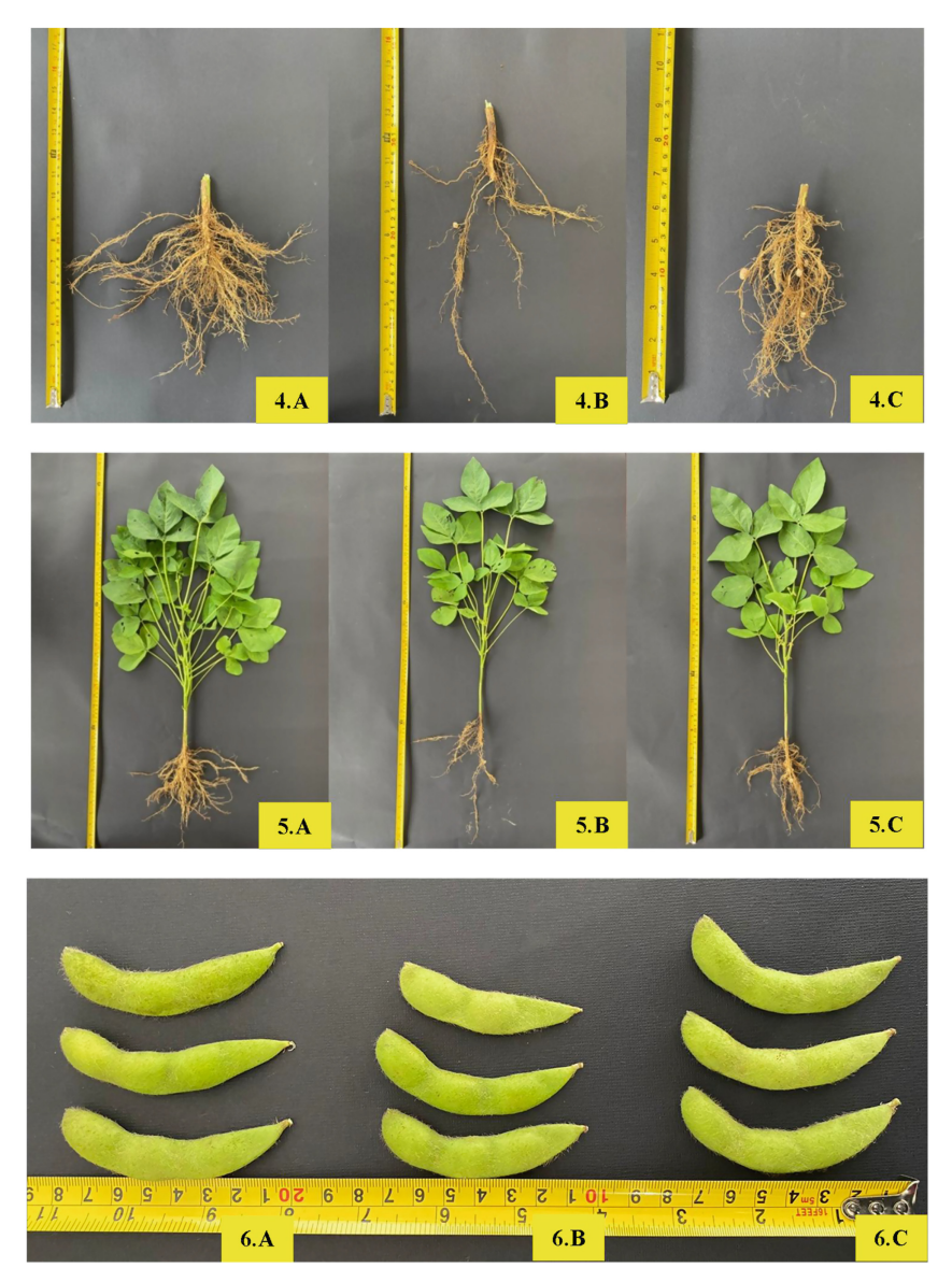
Fig. 2. Performance of roots (4), plant structure (5) and pods (6) of edamame. Note: treatments of goat (A), cow (B), and chicken manure (C).

[29] reports that application of goat manures was significantly improving relative root elongation on commercial commodities such as Chrysanthemum indicum L., Raphanus sativus , Brassica rapa , Sesamum indicum L., and Daucus carota . Macronutrients such as N and P elements had magnificent and beneficial effect on both aerial and root growth.