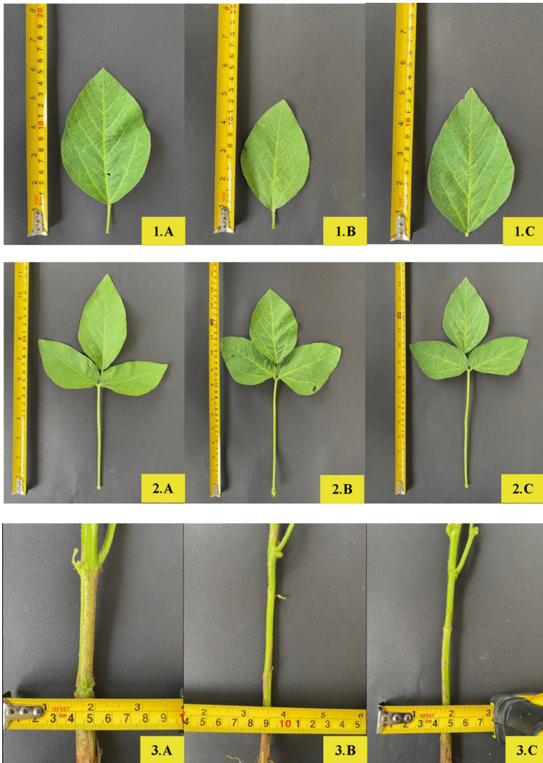
Fig. 1. Performance of leaves (1 and 2) and stem (3) of edamame. Note: treatments of goat (A), cow (B), and chicken manure (C).

The growth of roots in plants was also the important parameters to interpret nutrient dynamics and adequacy. The growth of roots was presented in Fig. 2. Application of manures in many previous studies enhanced root elongation by modifying soil nutrients condition as suitable for plant growth. [28] stated that root length was influenced remarkably amended by goat manure and positively correlated with the existence of P elements.