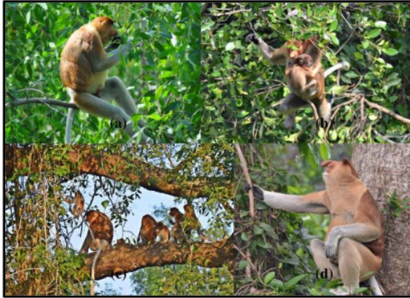
Figure 4. Daily Activities of Proboscis Monkeys: (a) Feeding, (b) Moving, (c) Social, (d) Resting