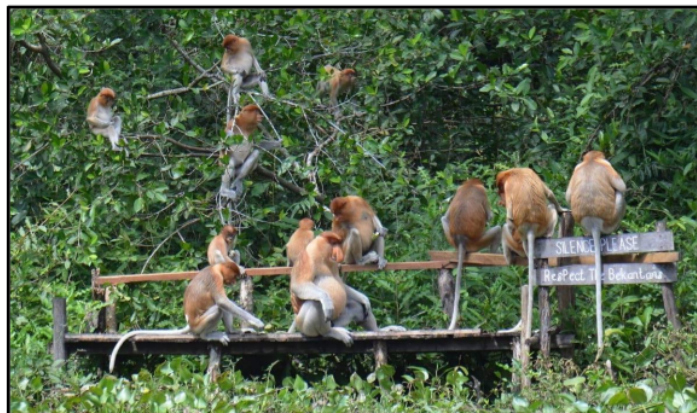
Figure 3. A Group of Proboscis Monkeys in the Curiak Island Area

with an adult individual sex ratio of 1:3. A group of proboscis monkeys in the Curiak Island area can be seen in Figure 3.