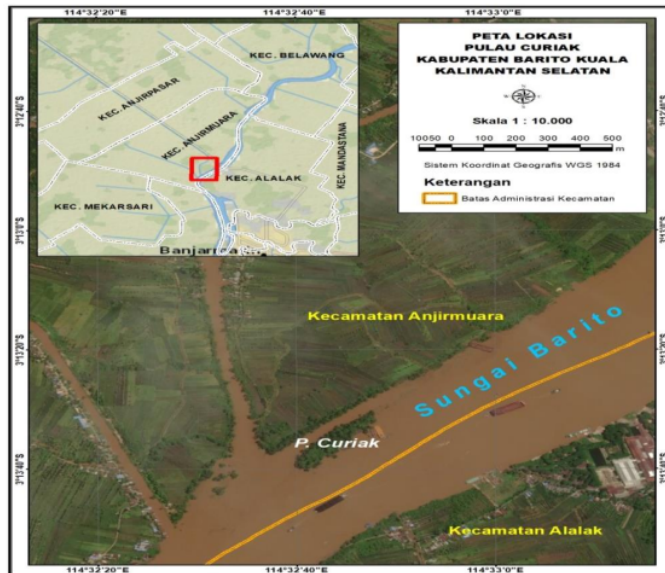
Figure 1. Map of the Curiak Island Area

monkeys observed were proboscis monkey population, daily activities of proboscis monkeys, and home range of proboscis monkeys