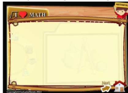
Capture 2. Design of information on interactive multimedia learning CD package