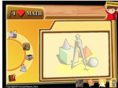
Capture 1. Background Main Page