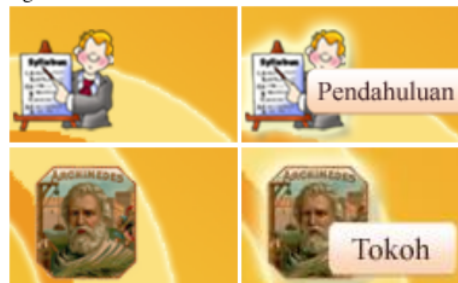
Capture 3. Samples of buttons and their response

At the collecting material stage, the collection of video, animation, instrumental music and the results of the development of test instruments that have been tested and then will be applied to interactive multimedia learning.