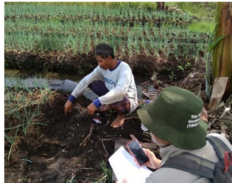
Fig. 3: Peatlands Managed by Communities

The form of mitigation is carried out by the community before a fire occurs by protecting the land, especially the land they manage. People have an economic interest in the ground because the land is their source of livelihood. The community is very concerned about keeping the land from burning further. They have bore wells that will be used when there is a fire. Burning the land to prepare the ground was carried out to ensure that the fires did not spread. Economic re-vitalization by utilizing land that is prone to burning to land productive turns out to be far more effective in reducing land fires in this region than merely calling for a ban on burning land (Figure 3).