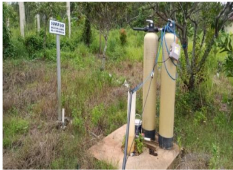
Fig. 2: Drilling Well Located on Agricultural Land

Meanwhile, the procurement of drilled wells will directly affect them. Drilled wells can be used to irrigate agricultural land and, at the same time, extinguish fires when fires occur. Another way is to provide abandoned land to be managed by the community so that people are responsible when a fire occurs.