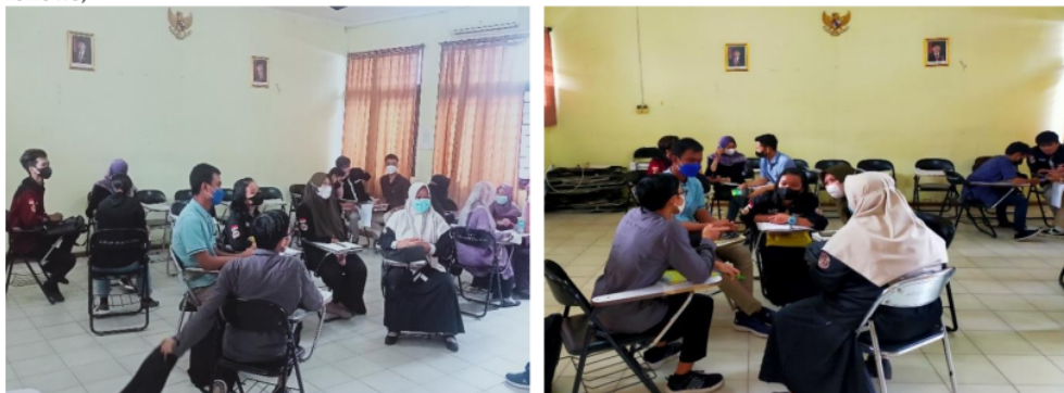
Figure 5. Learning Critical Discourse Analysis

Based on observation, student's gave opinion indicates how to master the phenomena during the 2019 presidential election. However, factually based on the study results, students still found it difficult to relate the problem of verbal abuse in a social context. A student named Nadia (18 years old) stated that "Insults on social media through comments are common. It is because everyone can like and hate other people. The opinions conveyed indicated that verbal abuse that occurred was common. It means that it does not need to be widened and is crucial. The documentation of the course of learning is as follows;