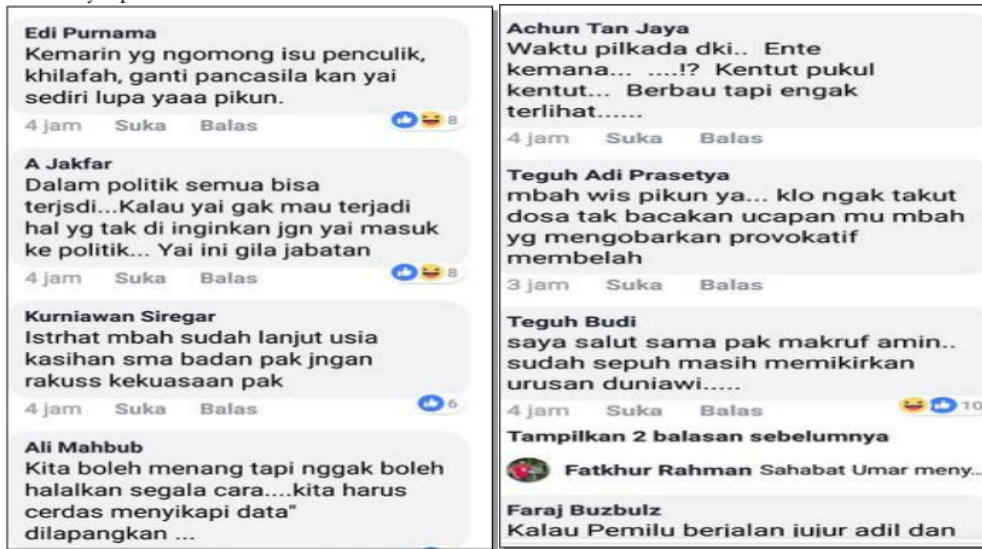
Image 1. Snippet of Insulting Text

Insults of verbal abuse are quite common. It is because the insulting word appears explicitly in the sentence utterance. For example, the following is an image of a snippet of text indicating an insult hurled by a political elite and a civilian.