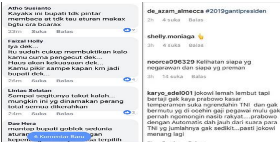
Image 2. Derogatory Snippets of Text

From the fragment of the text, it appears that Prabowo is considered a low-quality leader candidate, likes to humiliate the TNI. The word TNI is an abbreviation of the Indonesian National Army. The verbal abuse was caused when the Probowo debate said, "I am more TNI than TNI." In addition, Probowo is considered to have an arrogant personality. This sentence is a conclusion that does not deserve to be presented. It is because the demeaning aspect touches the realm of the state apparatus. The TNI, which has duties and functions carried out based on state political policies and decisions, namely upholding state sovereignty and sovereignty, is massively humiliated by its citizens.