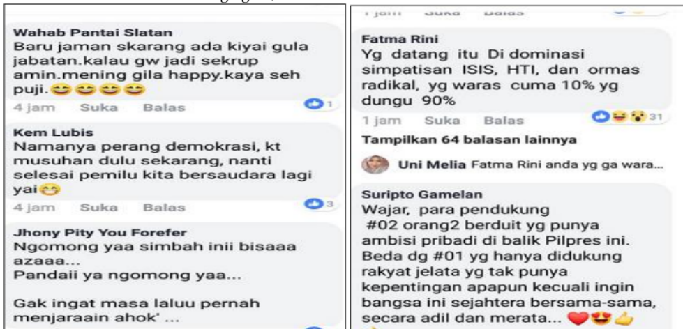
Figure 3. Snippet of Text that Accuses

Verbal abuse in accusations was found for candidate pairs number 1 and 2. Indications of verbal abuse can be seen in the following figure;