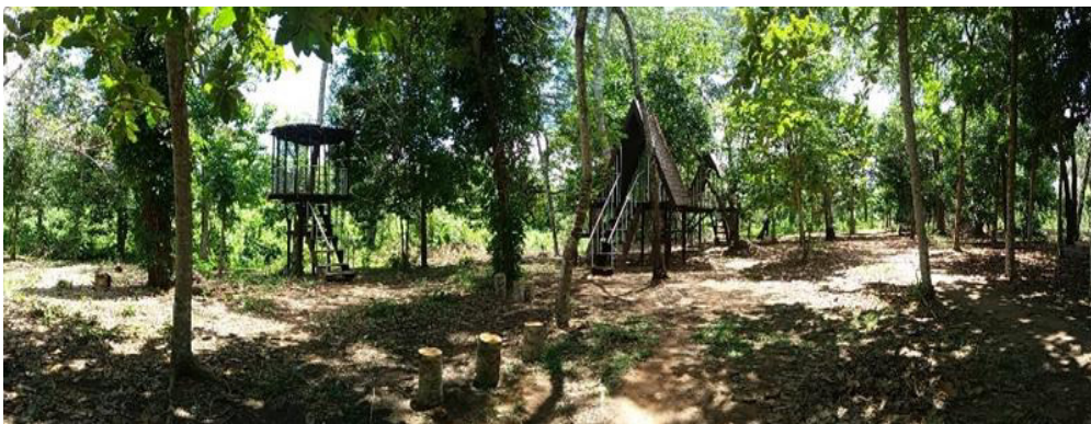
Figure 2. Landscape of the City Forest Park area

The landscape of the City Forest Park Area has a very sloping topography. There are some shade trees (cover), but no large pasture land for grazing. This of course will make it difficult for managers to provide feed. The availability of water reserves is relatively quite a lot. The location of the area is relatively close to offices and settlements with a higher population density than the other 2 options. The description of the landscape in the City Forest Park area is shown in the following figure: