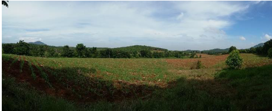
Figure 1. Landscape of Mount Kayangan Kawasan