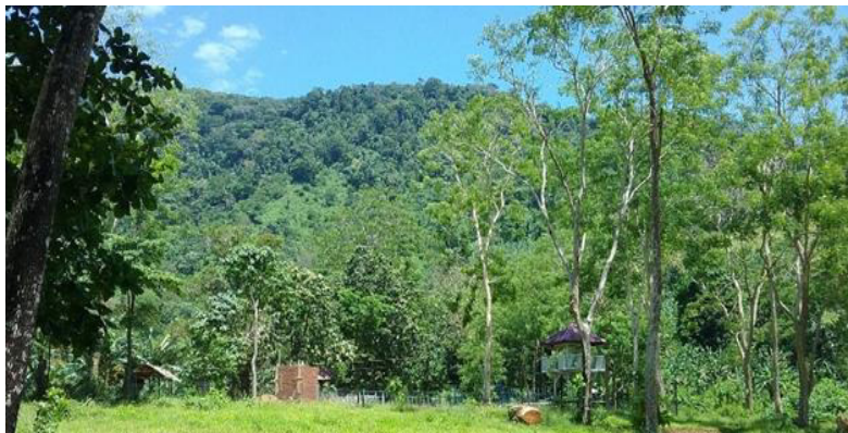
Figure 3. Landscapes in the Bajuin Waterfall Area.

This area has a fairly varied elevation and slope. The slope of the area in the visitor parking area is about 7% with an altitude between 56 m above sea level to 75 m above sea level, while the area around the location of the waterfall has an elevation of 102 – 122 m above sea level and a slope of about 65% (steep), although near the parking location there are few the land is quite sloping with a slope of about 2-3%. The dam construction plan will be carried out at the location of the Bajuin waterfall area. The description of the landscape in the Bajuin Waterfall area is shown in the following figure: