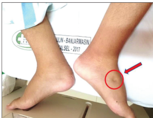
Figure 3: Leg edema

An abdominal computed tomography (CT) scan, without contrast, revealed chronic processing of both kidneys with ascites, therefore supporting sclerosing encapsulating peritonitis (SEP) underlying PD.