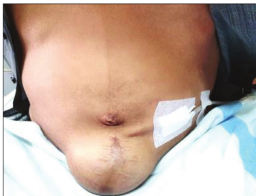
Figure 2: Incisional hernia

swelling of both lower legs. This also resulted to a soft, intermittent bulge in the surgical suture area expanding into the abdominal cavity after filling the dialysate and decreases with subsequent drying. The bump is clearly visible as the patient sits or stands but disappears at lying down. Further observations include less appetite, often nauseous, defecates less smoothly, and hard sensation on the lower right abdomen, as well as a 7 kg weight loss in the last 5 months. There was also 2-year history of hemodialysis (HD) with a switch to CAPD for a year. During PD, the patient suffered peritonitis for the 3 rd time, with the latest encountered 4 months ago.