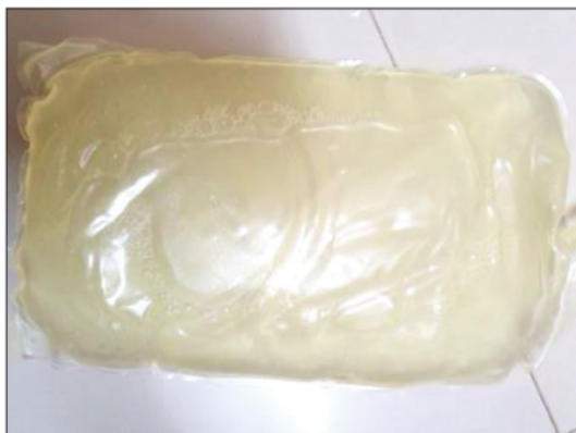
Figure 1: Continuous ambulatory peritoneal dialysis fluid