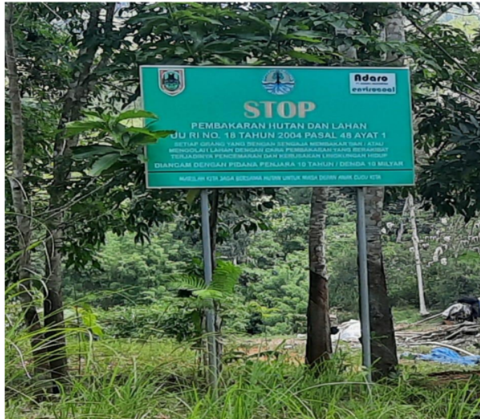
Figure 2 – Banners prohibiting forest burning in Awang Bangkal Barat Village

The prohibition is stated in Article 36 point 17 of the Job Creation Law which amends Article 50 paragraph (2) letter b of Law Number 41 of 1999 concerning Forestry which reads "Everyone who intentionally burns forests is threatened with a maximum imprisonment of 15 years and a maximum fine of Rp. 5 billion. If forest fires are caused by negligence, the threat of imprisonment is a maximum of 5 years and a maximum fine of IDR 3.5 billion.