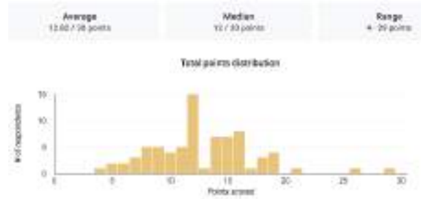
Figure 2 Results of Students' Pretest

Figure 2 shows that the results of students' pre-test before using E-poetry were on the average of 12.83 points out of 30 points. The median of student points was worth 12 points out of 30 total points with a variety of 4 to 29 points.