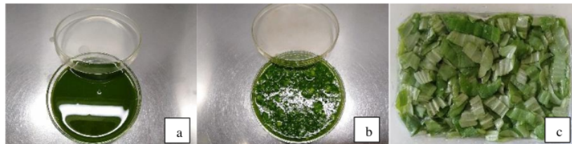
Figure 1. Water lettuce feedstock forms (a) extracted (b) mashed (c) cut into pieces.

The processed feedstock for each treatment that extracted, mashed, and cut into pieces showed differences in size and texture. Based on the composition and formulation that has been processed, the extracted, mashed, and cut were 50, 250, and 350 ml, respectively. Extracted and mashed feedstock placed in a Petri disk was 15 ml each, while cut was in a 500 ml mold container. The extracted feedstock had a smoother texture compared to those mashed and cut. The feedstock processing showed a slight colour change but, in general, still showed a green leaf colour. In all treatments of feedstock, there was no pungent aroma. The feedstock forms of water lettuce for each treatment had provided in Figure 1.