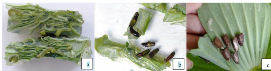
Figure 3. Larvae (a), pupa (b), and adult (c) of S. pectinicornis in the treatment of cut feedstock.

The results showed that larvae S. pectinicornis ate a little in the extracted and mashed feedstock, thus proving that the color, smell, or compounds possessed by the water lettuce were not enough to larvae S. pectinicornis attract to eat. It caused the larvae to starve and cannot survive. Besides the compounds contained in the water lettuce, both as a source of nutrition and other roles, it predicted that the larvae of S. pectinicornis attract to the morphology of the water lettuce. It had proven in the cut feedstock, which has the shape and texture of the leaves of water lettuce so that the larvae are interested in eating and can complete the stages of development into pupa and adult (Figure 3).