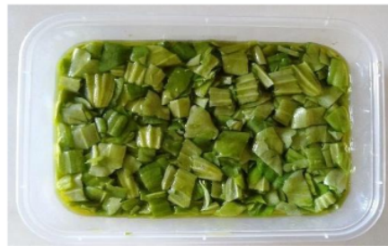
Figure 4. Feedstock that added nutrients and preservatives.

The larvae fed with those enriched feedstocks seemed to move away, and after 1-2 days were died. It indicated that the enriched feedstock was not suitable for larvae S. pectinicornis . The incompatibility of insects to their feed had marked by the minimum food consumption, low endurance, and decreased fertility that implies lowering population density. It caused by the presence of certain compounds so that insects not to be interested in consuming them [23].