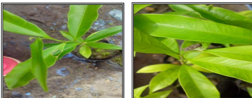
Fig. 3. Cause of damage by pest

disease (32%), Insects that attacked were grasshoppers, spiders, and snails.