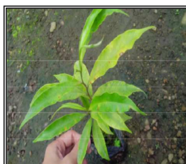
Fig. 2. Cause of damage by disease

Pracaya (2009), revealed the turn of initially bright green leaves to yellow, and dim green or pale green is called chlorosis. Discoloration (chlorosis) is caused by a damaged or malfunctioning chlorophyll or green substance. Pracaya has also stated the biggest attack of agarwood seedlings is a disease due to abiotic factors characterized by symptoms of chlorosis, which is caused by a deficiency of nutrients N and leaf spot disease. Causes of damage of agarwood seedlings in present study can be seen on Table 5.