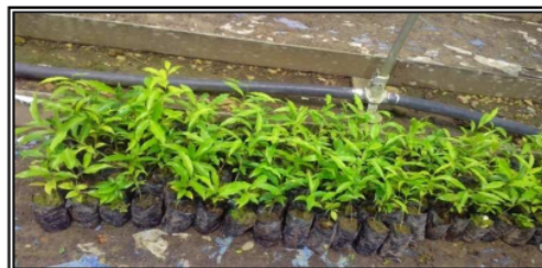
Fig. 1. Aquilaria malaccensis

Gaharu ( Aquilaria malaccensis ) is a tree species included in Thymelleaceae family. Agarwood can grow in lowland as well as mountains, up to 750 m above sea level. The average temperature required is 32 ° C and the average humidity is 70%, with annual rainfall of about 2000 mm. This plant produces a resin powder which has a distinctive aroma fragrance infected due to fungal diseases (fungi) that enter through the trunk wound. Some types of Agarwood plant known among others are Aquilaria malaccensis , A. filaria , A. hirta , A. agallocha , and A. macrophyllum . Of the potential plant species, Aquilaria malaccensis is the most valuable Agarwood economics view.