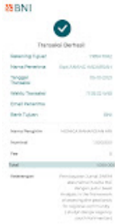
IMG-20211005-WA0021 (1).jpg 46K