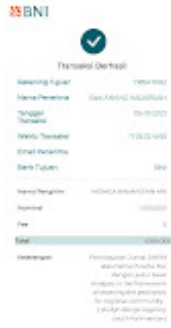
bukti pembayaran biaya pendaftaran.jpg 46K