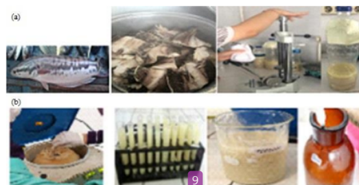
Figure 1. Preparation of Toman fish extract, where the meat of Toman fish was boiled and pressed using a hydraulic press (a) and the centrifuged supernatant was kept in the dark glass bottles (b) for further use.

wrapped in a flannel cloth and put in a hydraulic press for pressing (Figure 1). The produced liquid was measured (7.5 ml), then transferred into a centrifuge tube (Pyrex) and centrifuged at 6000 rpm for 15 minutes (Centrifuge PLC Series, Taiwan). Subsequently, a total of the separated supernatant (700 ml) and sediment (50 ml) were collected. Finally, the collected supernatant (Toman fish extract) was stored in dark glass bottles and covered with a clean aluminum foil and stored in a refrigerator (15°C) for subsequent use.