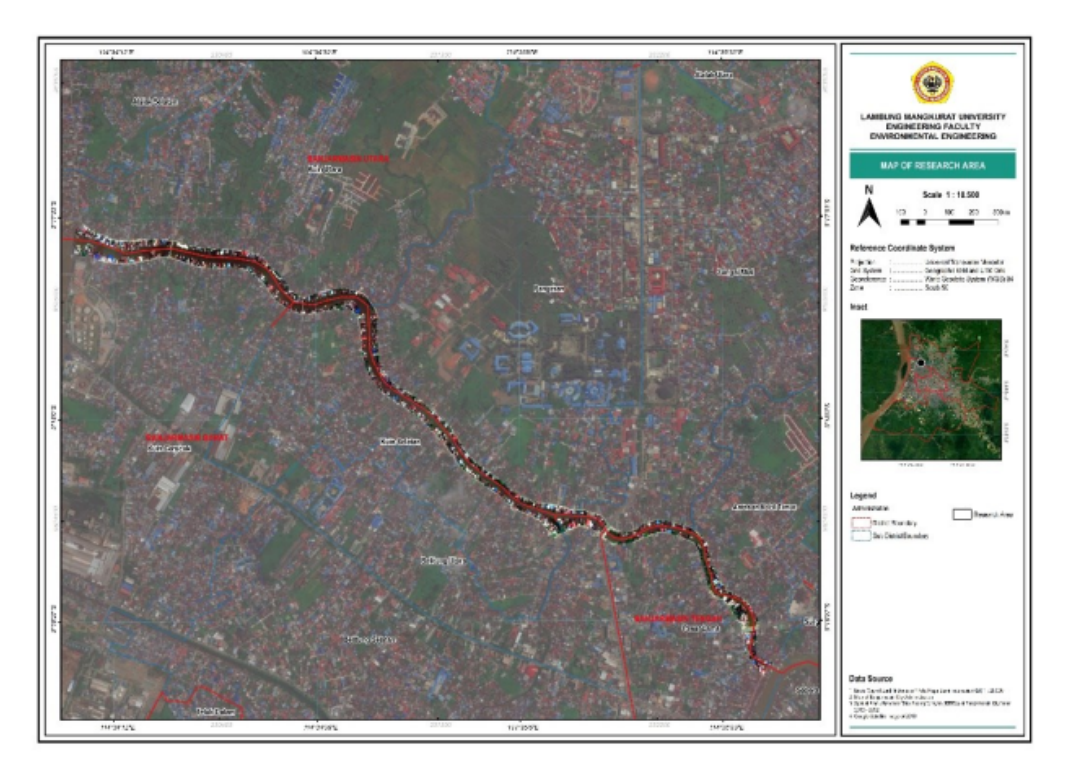
Fig. 1. Map of Research Area

The Kuin River has a length of 3909 meters, with a width of 7-61 meters. This river passes through 8 villages, namely Antasan Kecil Timur, Sungai Miai, Pangeran, Kuin Utara, Kuin Cerucuk, Kuin Selatan, Belitung Utara, and Pasar Lama. The existence of this river is very important for water transportation activities and bathing, washing and toilet activities for the community along the river. More clearly can be seen in the following Figure (Fig. 1).