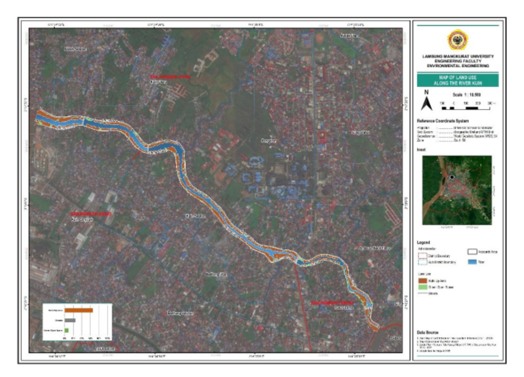
Fig. 2. Map of Land Use Along The River Kuin

The road is described as a gray zone which is the access that connects between villages in the region. From the analysis of the gray zone, the value is only 25.12%, meaning that road access is very narrow for very dense areas. This can result in severe congestion in this region. The actual percentage of green, grey and build up areas as shown in the block diagram in Fig. 3.