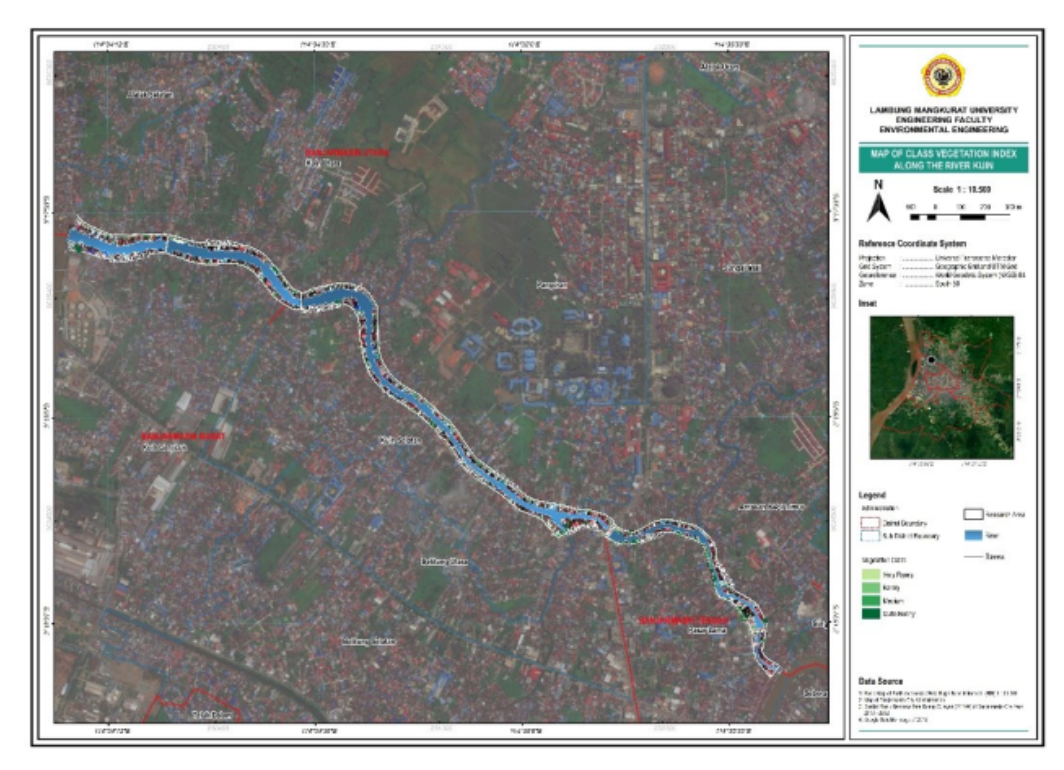
Fig. 4. Map of Class Vegetation Index Along The River Kuin

The road is described as a gray zone which is the access that connects between villages in the region. From the analysis of the gray zone value of only 25.12%, meaning that access to vegetation index is the result of the transformation of the spectral value of several channels of remote sensing images for the prominence of the spectral value of vegetation. Vegetation is one of the main parameters in GOS. The existence of vegetation in the GOS environment contributes to many things in the balance of an ecosystem. Index vegetation is the value generated from a number of remote sensing data used to measure vegetation cover on the earth's surface. Based on the vegetation index analysis (Fig. 4) in riparian area of The River Kuin there is an area of 5,093.6 square meters with very rare vegetation density and about 2,865.3 square meters with very dense vegetation density. The road is very narrow for very dense areas. This can result in severe congestion in this region.