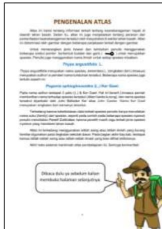
Figure 3. Introduction to the contents of the atlas (How to use the atlas)

The feasibility of presenting is also evident from the quality of the illustrations presented in the learning atlas. To ensure the quality of the illustrated images in the atlas, the images are developed independently so that they match the contents of the atlas. The image adapts the cartoon image to match the target of the media, namely elementary school students. The highlighting of images compared to text in the atlas adjusts to the characteristics of the atlas itself, where the image aspects in the atlas are more than the text (Abrori & Adhani, 2017).