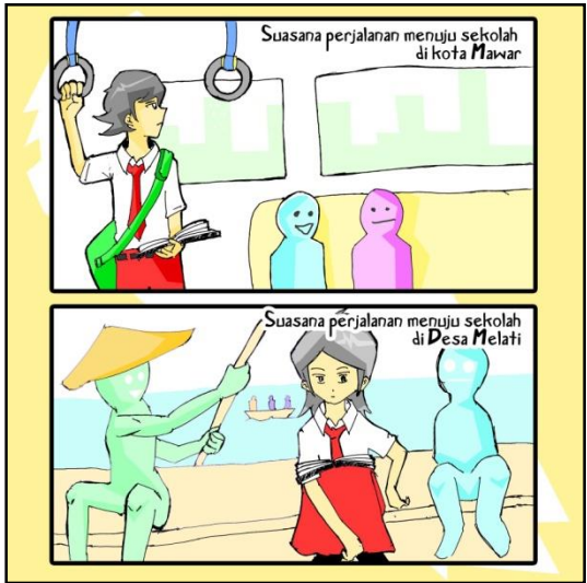
Figure 1. Strip Comic Layout

Based on result from student response related to student responses and reactions are described in Table 1. The responses are measured by a