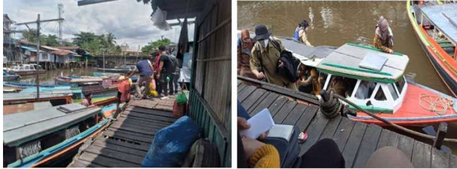
Figure 2. Klotok Services at Trisakti Klotok Pier