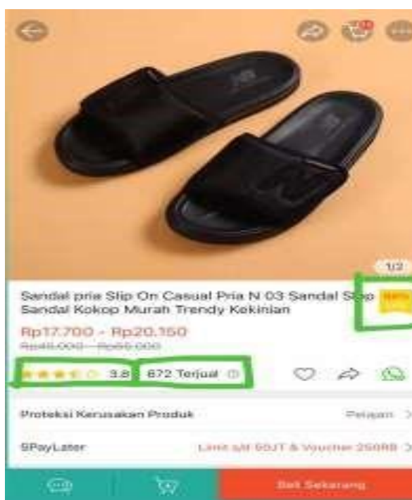
Figure 2. Online customer rating in Shopee

Figure 2 indicates a low rating as it only gets 3.8 of 5 stars. However, the store can sell up to 672 items. When Gen Z gets low prices plus discounts and a large selection of products in the store, ratings are no longer the main reason they make purchases.