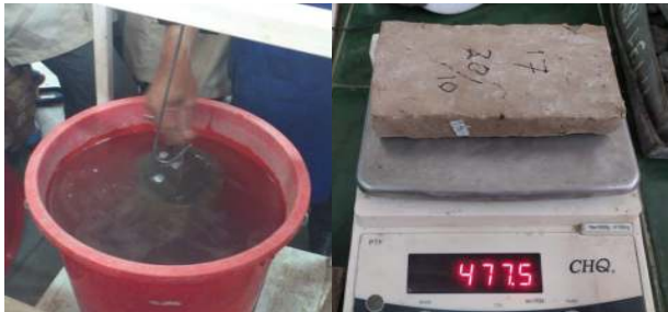
Figure 7. The Brick Apparent Density Test

Based on the apparent density test results was obtained the average of apparent density value is 1.33 g/cm<sup>3</sup>. The apparent density value of bricks meets SNI 15-2094-2000 because it is higher than the minimum apparent density value required in SNI 15-2094-2000, which is 1.2 \text{ g/cm}^3 . The apparent density test results of 10 bricks can be seen in Table 9. The brick apparent density test as shown in Figure 7.