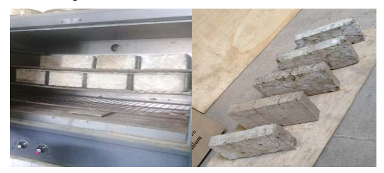
Figure 3. The Brick Visibility Test in Oven-Dry Condition

Based on the visible properties test results of the bricks in oven-dry condition as listed in Table 3, it was found that of the 10 bricks tested none of them met the flat-shape, elbow-shape and has no cracks as required in SNI 15-2094-2000. Although out of the 10 bricks there are 7 pieces (70%) bricks that have a flat-shape and all bricks (100%) have an elbow-shape, all bricks are considered not to meet the SNI 15-2094-2000 standards because all bricks have cracks which cracks included in the weight category. The bricks visibility test in oven-dry condition as shown in Figure 3.