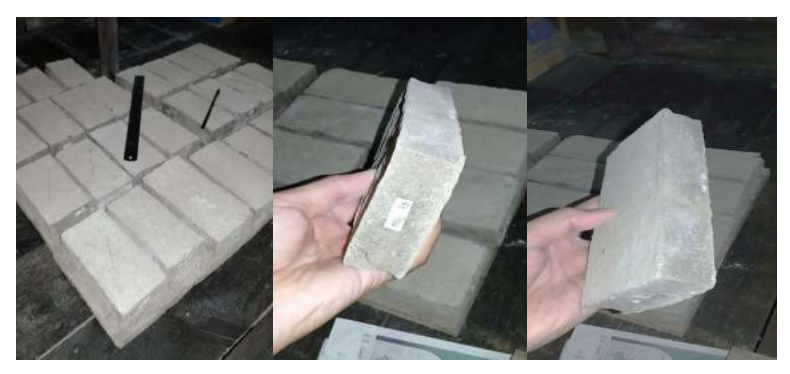
Figure 4. The Bricks Visibility Test in Wind-Dry Condition

Based on the visible properties test results of the bricks in wind-dry condition as listed in Table 4, it was found that of the 10 bricks tested there were 5 (50%) bricks that met the flat-shape, elbow-shape and has no cracks as required in SNI 15-2094-2000. Out of these 10 bricks, there are 7 bricks (70%) that have a flat-shape, 3 bricks (30%) with curved-shape, 10 bricks (100%) have elbow-shape, 5 (50%) light cracked bricks and 5 (50%) bricks with no cracks at all. The brick visibility test in wind-dry condition as shown in Figure 4.