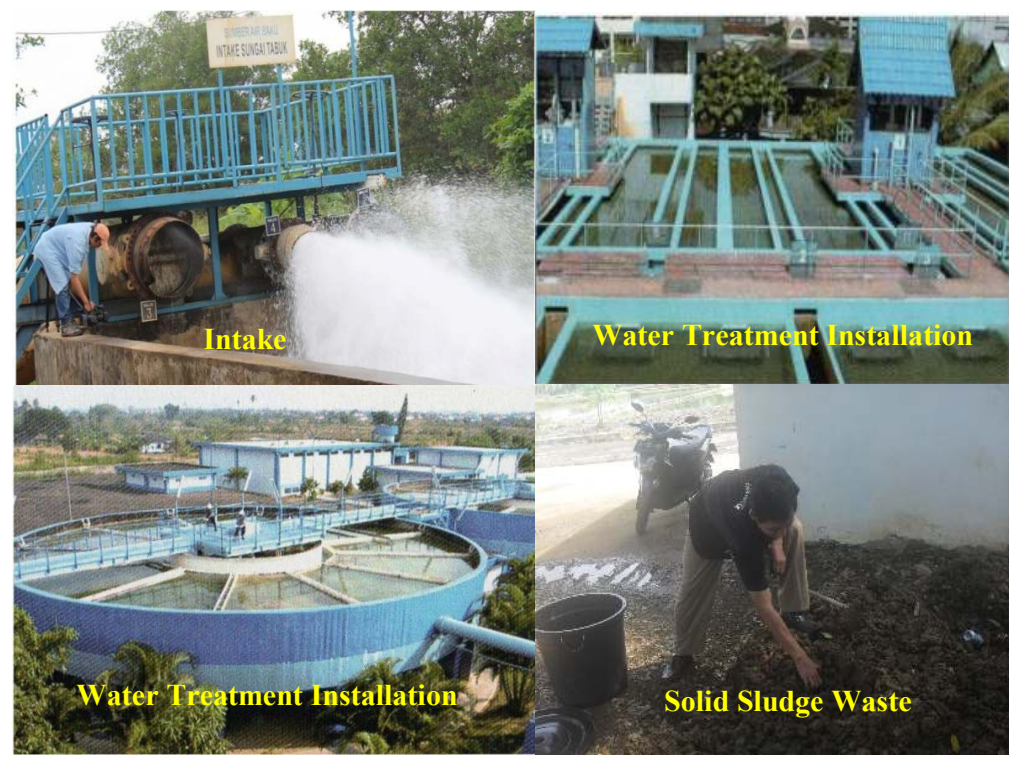
Figure 1. Water Treatment Installation 2 PDAM Bandarmasih and Solid Sludge Waste