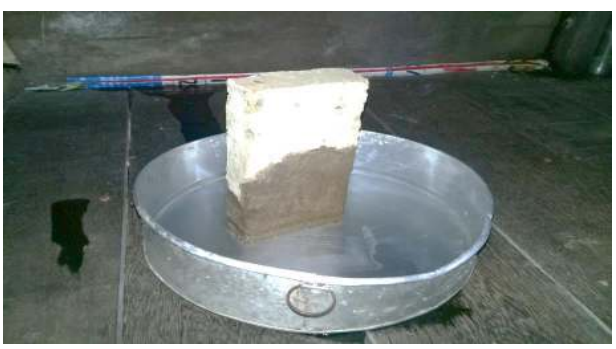
Figure 6. Soaking Bricks for Salt Crystals Observation

The bricks used in the harmful-salt test are bricks that are dried by the wind. This test is done by checking how much salt crystals cover on the brick surface. Based on test results of 5 bricks obtained 100% of bricks have a salt crystal surface area of less than 50% of the total surface area of the bricks, so according to NI-10, 1978 these bricks are categorized as not harm. The harmful salt test results can be seen in Table 8. Soaking bricks for salt crystal observation can be seen in Figure 6.