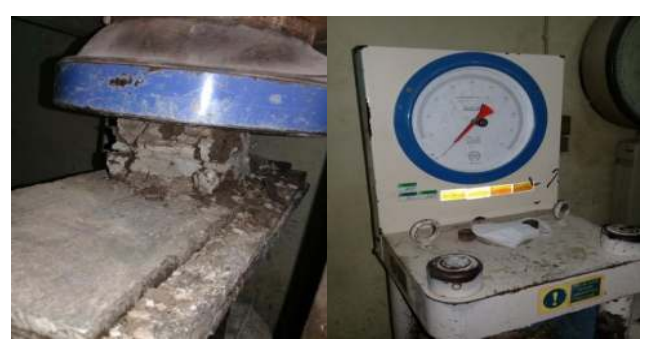
Figure 5. The Bricks Compressive Strength Test

Based on the compressive strength test results obtained the average compressive strength value of 17.79 \text{ kg/cm}^2 , as listed in Table 7. The average compressive strength value of bricks does not meet the SNI 15-2094-2000 standard, where the minimum compressive strength value of 30 bricks tested for the lowest class, which the lowest compressive strength of class 50 is 50 kg/cm<sup>2</sup>. The bricks compressive strength test as shown in Figure 5.