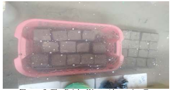
Figure 8. The Bricks Water Absorption Test