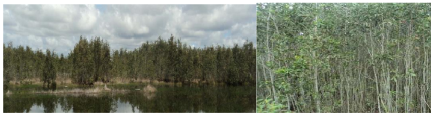
Figure 4: Stand of Melaleuca cajuputi in area of oil palm plantation.

Some areas with pure stands of M.cajuputi are allowed to develop naturally. This galam stand area can be reserved as a HCV area for the company. Although the diversity of pure galam stands vegetation are relatively low, galam stands can be a conservation area especially for waterbirds.