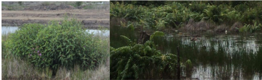
Figure 3: The undergrowth founded around oil palm plantation area.

Some areas with pure stands of M.cajuputi are allowed to develop naturally. This galam stand area can be reserved as a HCV area for the company. Although the diversity of pure galam stands vegetation are relatively low, galam stands can be a conservation area especially for waterbirds.