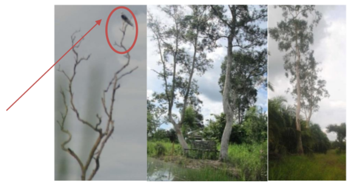
Figure 2: Melaleuca cajuputi stands in HCV area as habitat of birds.

The number of species found in each growth rate is relatively low, with seedling and poles with the smallest number, and sapling with the highest number of species. The highest diversity index value is at the tree level. Although the number of species and diversity of HCV vegetation is relatively low, the existence of these vegetation types gives a little additional value to the diversity of tree species. The existence of HCV has significance for animal habitat both for birds, mammals, and primates. The stand in the HCV acts as a place to find food and as a place for other animal activities. Large canopy trees with high crowns are shelters or nesting birds and nesting birds such as Harliastur indus (Figure 2).