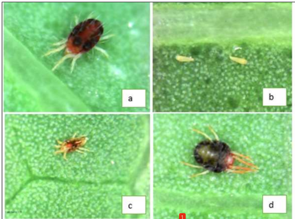
Figure 2. Four species of mites were obtained a: Tetranychus piercei ; b: Aculops pelekassi ; c: Brevipalpus phoenicis ; d: Eutetranychus africanus